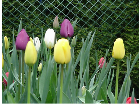
Tulips in the garden. 2000

The Prize to be sent out by the end of June.