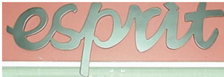
Esprit means 'Spirit'

I learned that perfumes can be created in four different mediums (alcohol, crème, glace, and oil) so there is a lot of versatility with them. I have always been quite sensitive to synthetic chemicals whether in the form of perfumes, cleaning products, air fresheners, or medications. My body doesn't respond to them very well. I can handle some of them, and have had favourites in all the categories mentioned, over the years. Thankfully, in my early twenties, I found medicinal herbs and in my late forties, I found essential oils through Aromatherapy. When one of my teachers mentioned that my blends smelled more like perfumes than remedies, I was stunned. I hadn't realized I could make natural perfumes until that point. Once I grasped this idea, there was nothing and no one who could stop me. I was hooked.