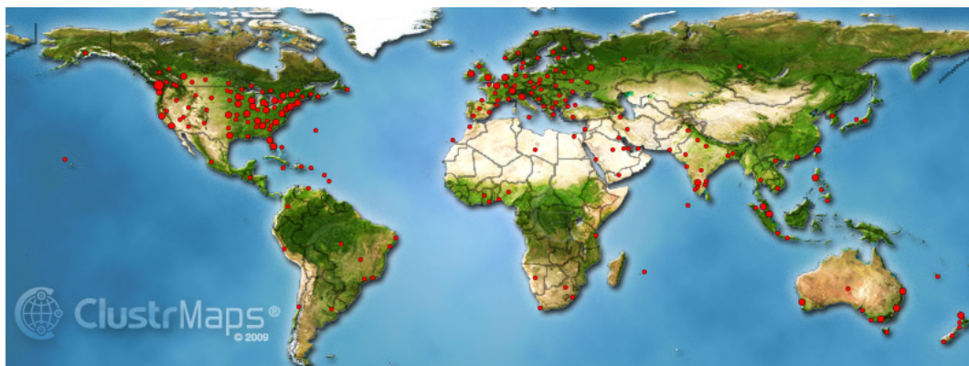
Students from around the world

I am self-taught through experimenting, books, and internet sites. I've also re-worked some of the knowledge gained in a variety of Aromatherapy courses and the Master Herbalist courses I've taken. I wish something like my Natural Perfume course had been available to me back when I started but there was nothing through correspondence, at that point (believe me, I scoured the internet). With a course and a mentor, it would have been so much easier to accomplish my goal of creating beautiful perfumes from natural essences. Nevertheless, I'm proof that it can be done on one's own.