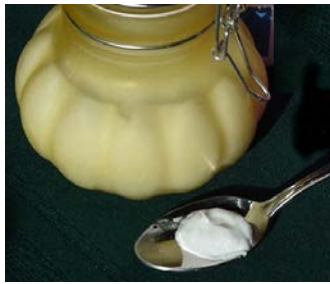
Crème de Shea perfumes