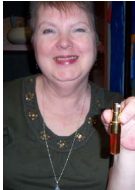
Essential Musk Fixative

musk notes. In so many ways, I wish I could still do so as I loved them. I've smelled Ethylene Brassylate and that is the note I remember, however, I cannot tolerate it now, even at .01%.