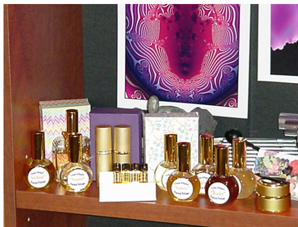
Alcohol & Oil-based perfumes