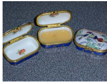
Solid (or 'glace') perfumes

But why perfumery in particular? What is it about scent that inspires you more than other medias? And what made you decide to use only natural ingredients?